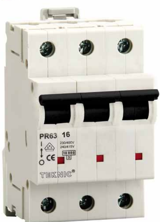
ISOLATORS - MODULAR SWITCHES - RV 60 SERIES