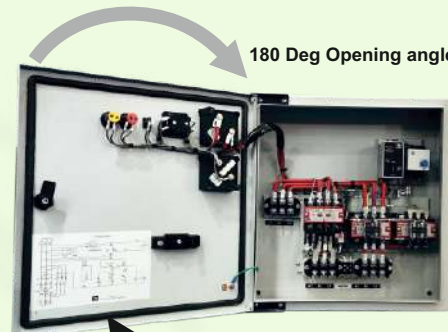
180 Deg Opening angle