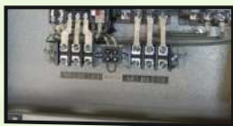
Better esthetic look & easy to maintenance to use of Bus-bar